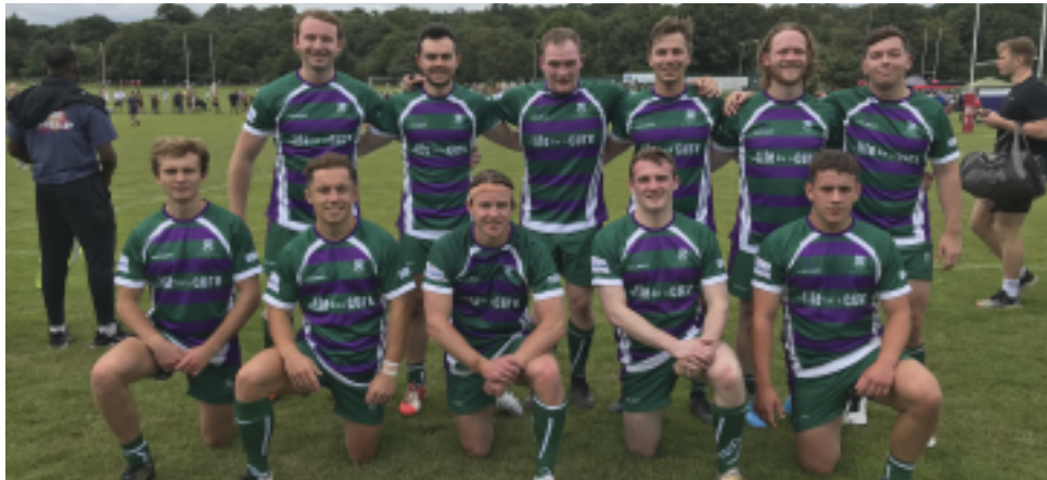
OC Rugby 7s team, winners of the Richmond Summer Social, August 2021