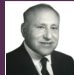
Lawrence Kadoorie, 1914 Industrialist and Philanthropist