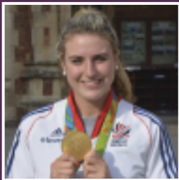
Lily Owsley, 2013 Olympic Gold Medallist