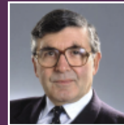
Patrick Jenkin, 1944 Cabinet Minister