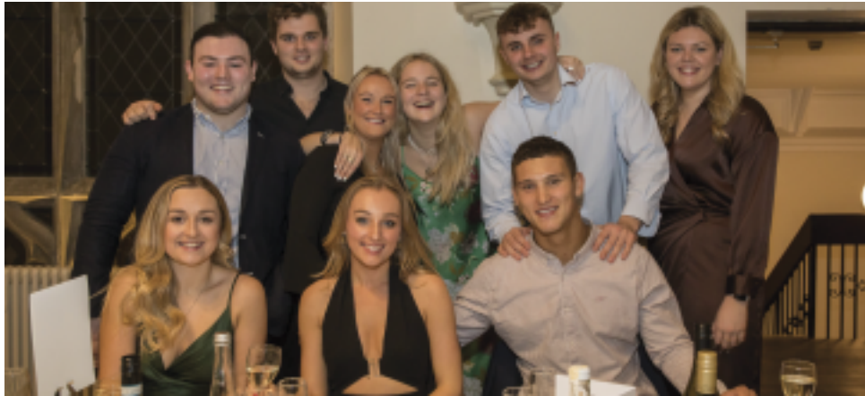
OC Bristol dinner, 2021