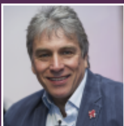
John Inverdale, 1975 Broadcaster