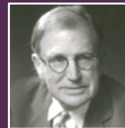
Nevill Mott, 1923 Nobel Laureate