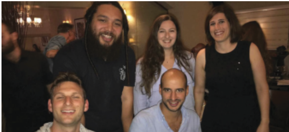
OC Tel Aviv dinner, 2017