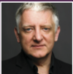
Simon Russell Beale, 1978 Actor